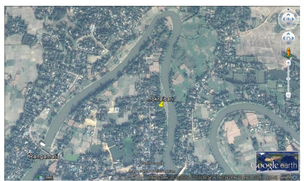
Figure 2. Selected reservoir location

By using Fuzzy logic method our selected location was L10 (Mokraibari). Also by using AHP method also best location was L10 (Mokraibari). So, in the both cases the outcome result was same. So the final selected location is L10 (Mokraibari) as shown in Figure 2.